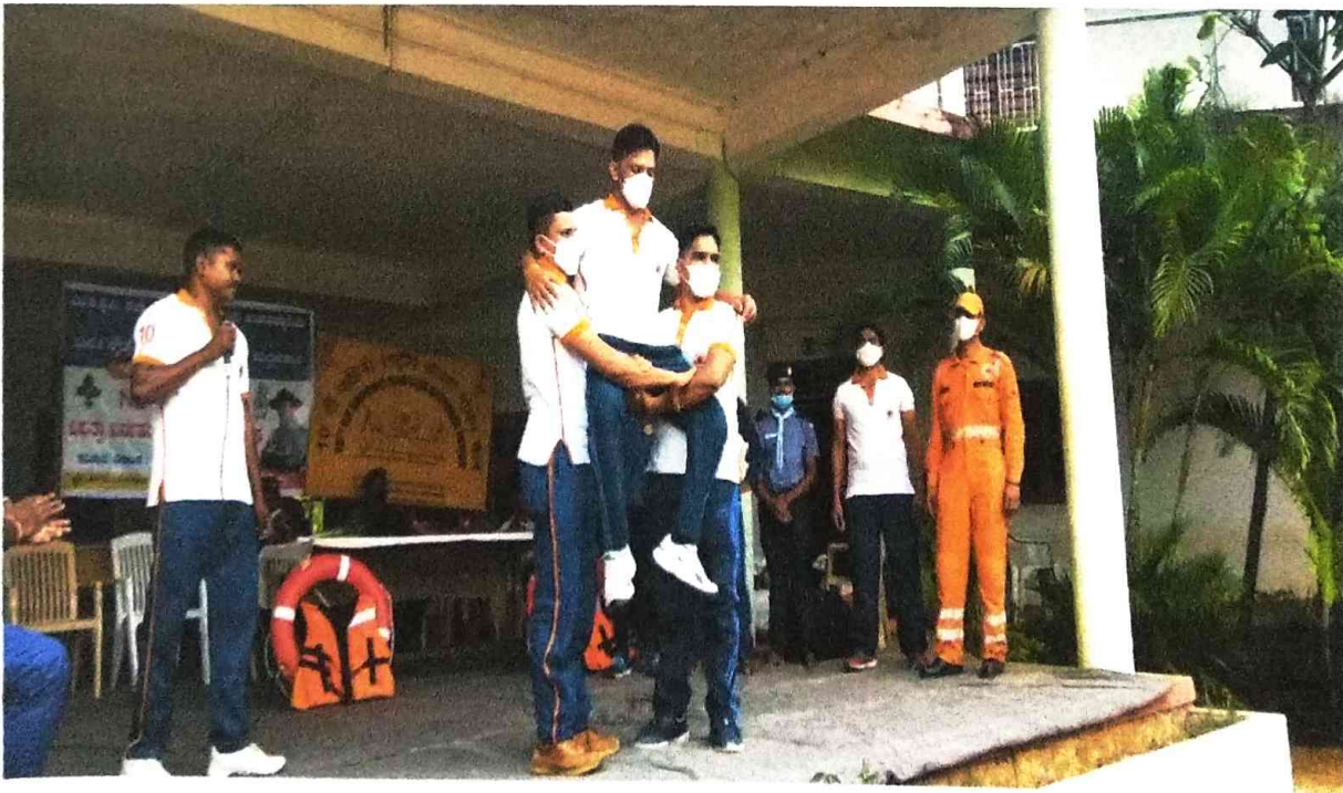
Figure 2 The National Disaster Response Force of India exhibiting different Life skills ON 13-11-2021