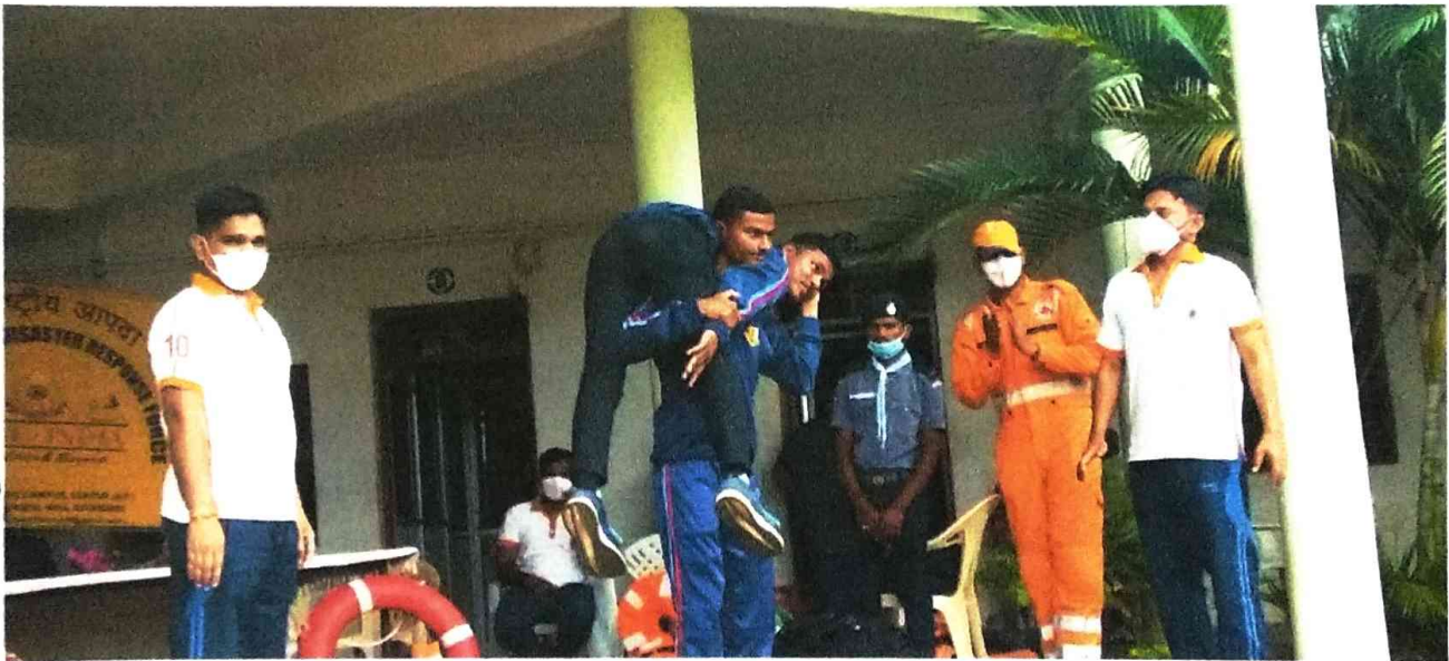
Figure 4 The National Disaster Response Force of India exhibiting different Life skills ON 13-11-2021

[Signature] Co-ordinator, Internal Quality Assurance Cell M.G.V.C. Arts, Commerce & Science College MUDDEBIHAL-586212. Dist: Vijayapur.