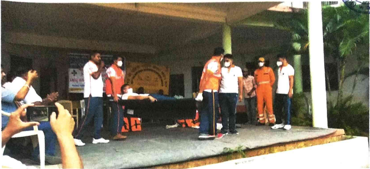
Figure 3 The National Disaster Response Force of India exhibiting different Life skills ON 13-11-2021